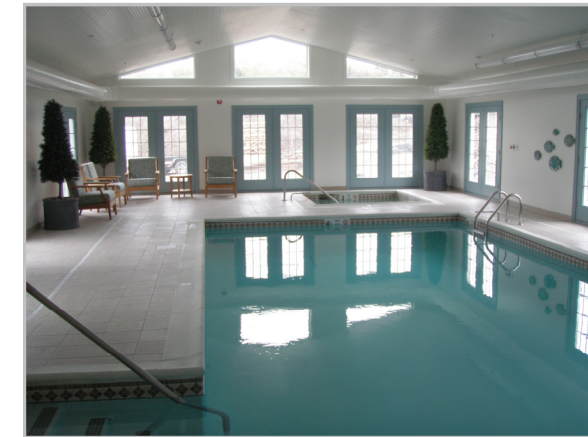
Clubhouse Pool at Eastwyck Village

This July, a grand opening is scheduled for Eastwyck Village Apartments, a unique luxury retirement community in North Greenbush for seniors 62 and older. No entrance fee or long-term lease is required.