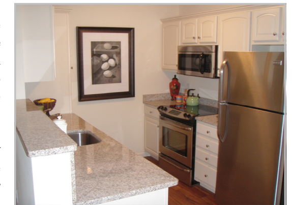
All kitchens have granite countertops and stainless steel appliances.

Equally exceptional are the distinctively designed apartments at Eastwyck which are equipped with stainless steel appliances, granite countertops, full size washer and dryer, and a porch or balcony. Monthly rents range from $1,225 to $1,915 and include full maintenance of the grounds and buildings, hot water, high speed internet, cable television, 24-hour emergency call system, and scheduled transportation. A wide variety of one-and two-bedroom floor plans are available ranging in size from 710 to 1,085 sq. feet. For more information, tours, or an application, contact the Eastwyck rental office at (518) 689-0750 or visit www.eastwyckseniorliving.com . ~Emily Pethic